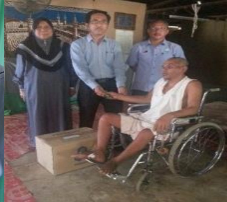
Activities by "PERKESO Prihatin" Squad